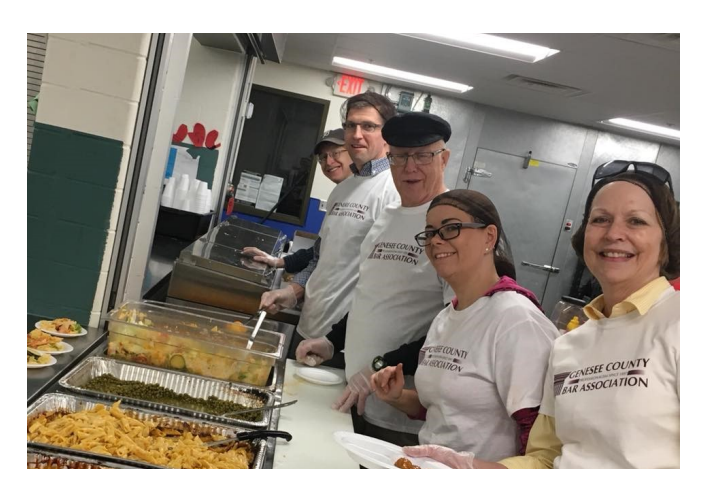
Sponsored by the GCBA Community Action Committee

South End Soup Kitchen 3410 Fenton Rd #1566 Flint, MI 48507