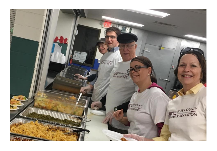
Sponsored by the GCBA Community Action Committee

Meet in the GCBA parking lot at 8:30 a.m. and we will carpool to the soup kitchen.