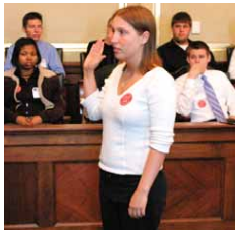
A witness takes the oath