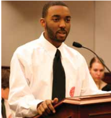
Attorney presents case