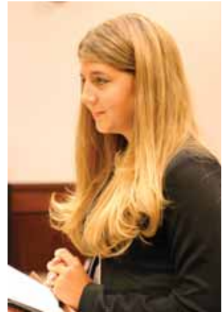
Opposing attorney presents case