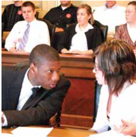
Defendant and attorney consult