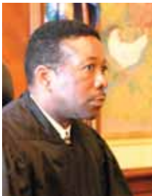
Hon. Archie Hayman